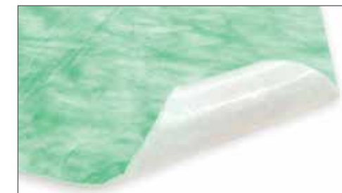
Surgisafe Absorbent Floor Mat with a fluid barrier non-slip backing