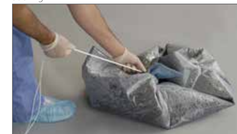
A Cinch Mat showing usage of the draw string cord